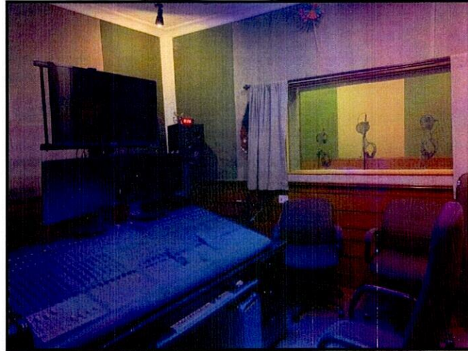
Ameen Sayani sound editing studio