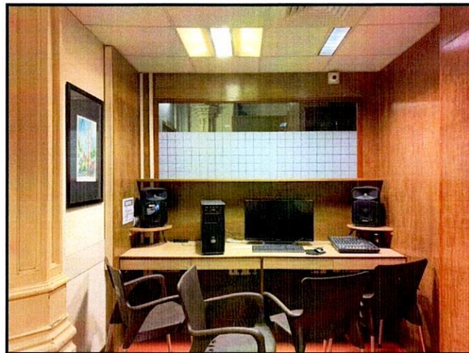
XIC- editing studio 2