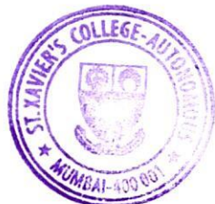
PRINCIPAL ST. XAVIER'S COLLEGE (AUTONOMOUS) MUMBAI - 400 001.